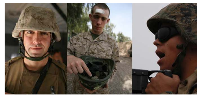
Requirements CTDS ID: 99229DA